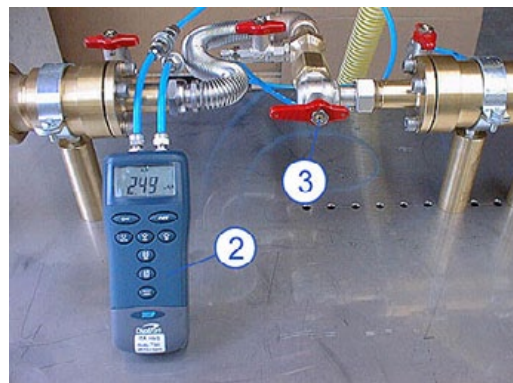
Differential pressure at the two ends of the valve (Pressure loss)