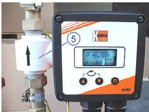
Magneto-inductive flow rate measurer